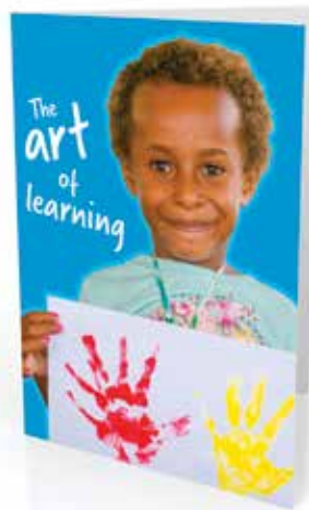
Order Code: GOM035

You can also select and pay for your cards online on the Gifts of Mercy page of our website. Visit: www.mercyworks.org.au