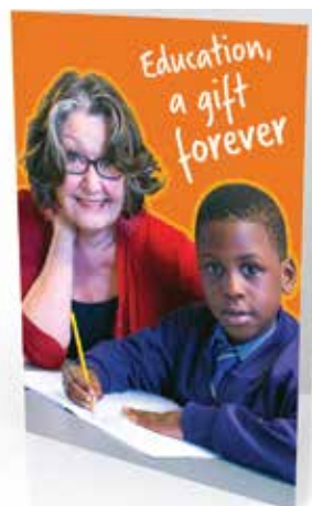
Order Code: GOM037