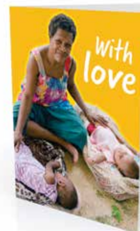
Order Code: GOM040