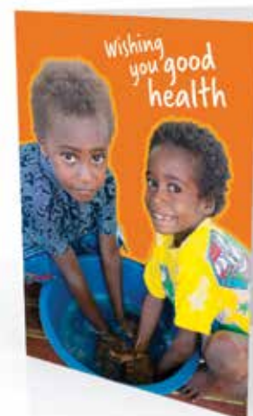
Order Code: GOM039