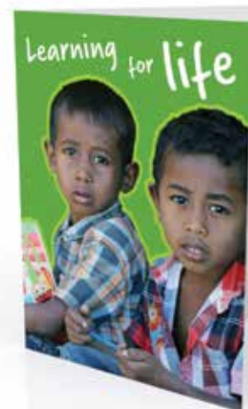
Order Code: GOM041