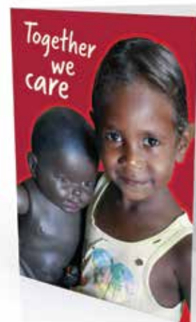
Order Code: GOM038