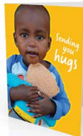
Order Code: GOM036